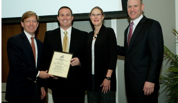
The City of Jacksonville Environmental Protection Board's awards were established in 1975 honor outstanding environmental accomplishments.